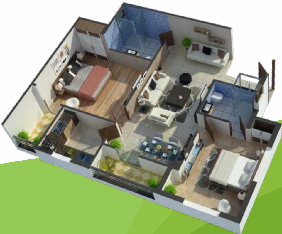
FLOOR PLAN 9th to 11th Floor

2 BHK | Type E | Super Area : 1358 sq.ft. Carpet Area : 882 sq.ft. Balcony :110 sq.ft.