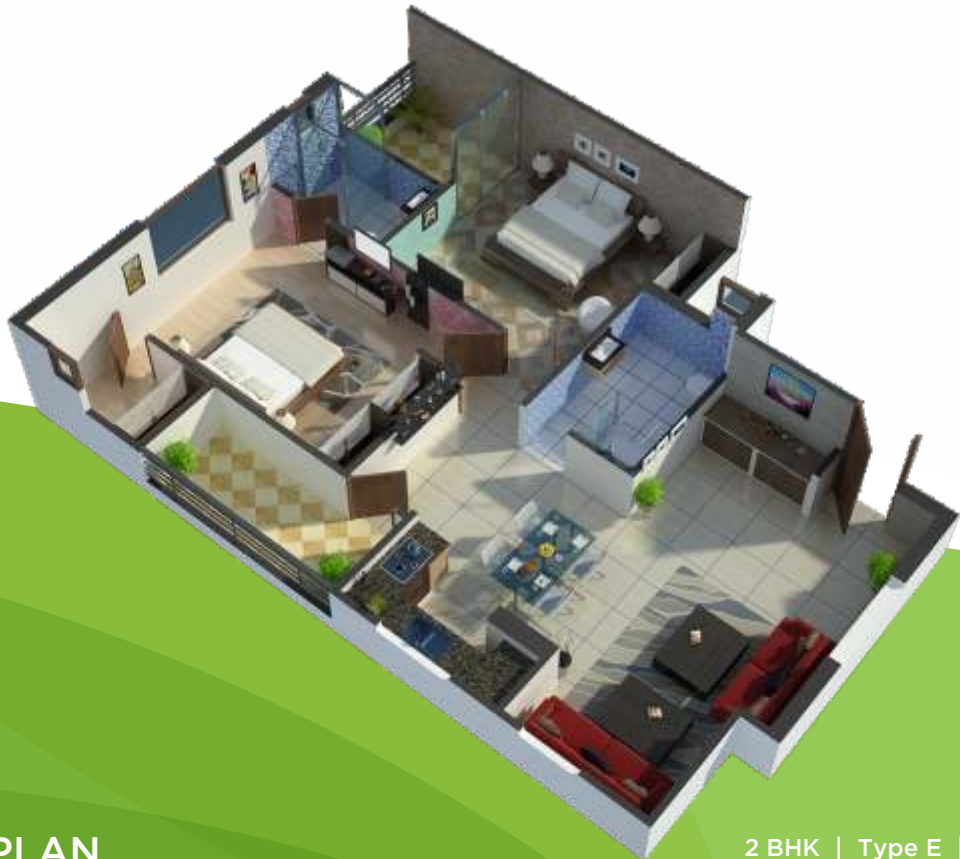
FLOOR PLAN 9th to 11th Floor

2 BHK | Type E | Super Area : 1358 sq.ft. Carpet Area : 882 sq.ft. Balcony :110 sq.ft.